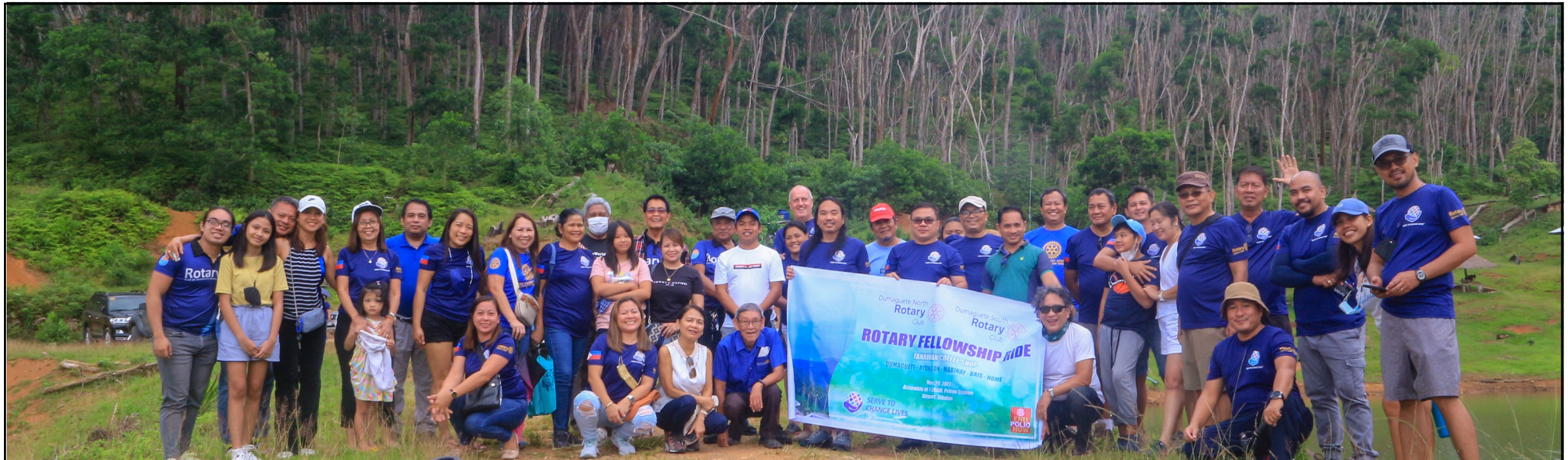
ROTARY FELLOWSHIP RIDE RY 2021-22