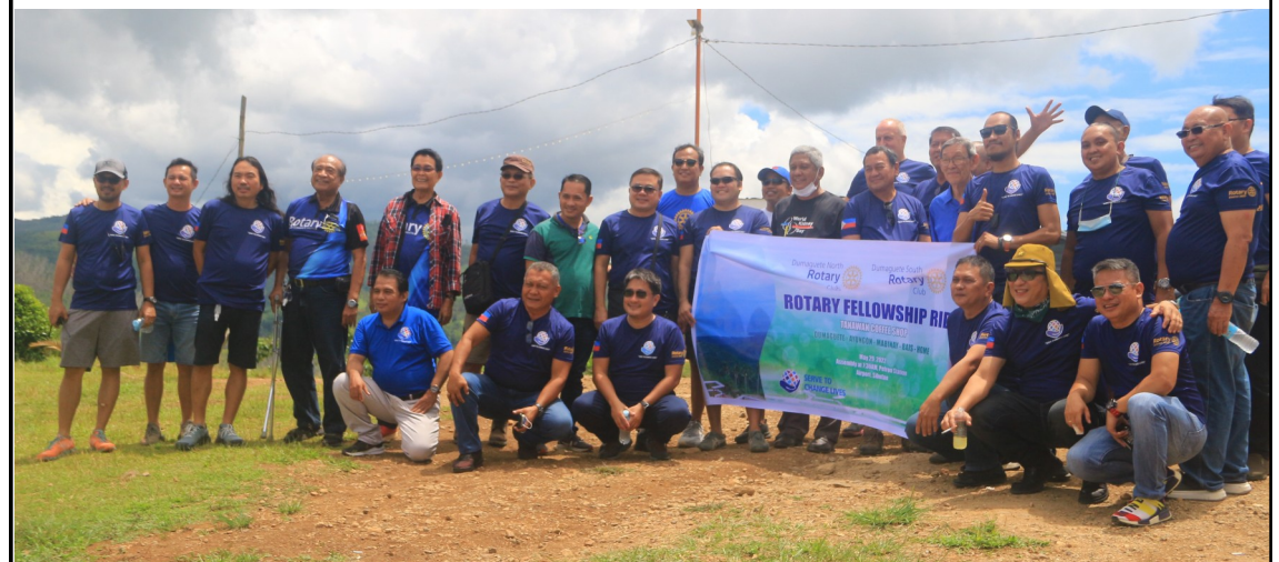
RC Dumaguete North and RC Dumaguete South