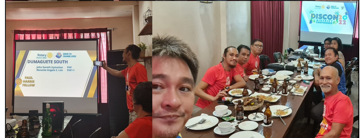
Together with the Rotary Club Dumaguete North—we attended the DISCON Virtual